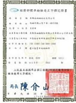
鋼管 CNS 正字標記證書 CNS CERTIFICATE